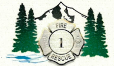
CLACKAMAS FIRE DISTRICT #1